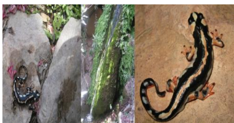
Figure 3. Real position of N. kaiseri in the Habitat.

As mentioned above, N. kaiseri has a special impression due to its special elegance. That is why many people maintain this endemic animal as for decorative purposes because of its unique body shape and public style.